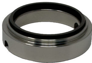
316SS / CARBON